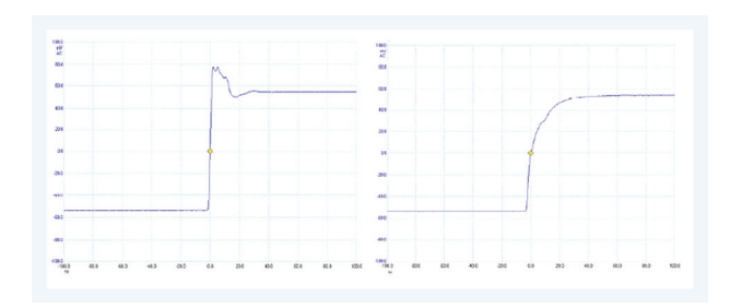
Figure 3: Over/Under Compensation

Figure 3 shows how over- and under-compensated pulse responses will look.