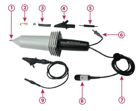
Figure 1: : CT4025 Probe Accessories